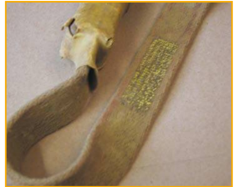
Figure 8 Missing label: damage to protective sleeve over energy absorber