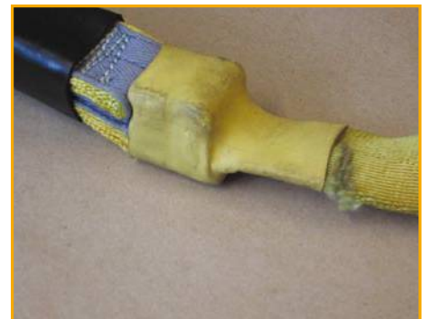
Figure 2 Abrasion damage adjacent to energy absorber: displaced protective sleeve over energy absorber