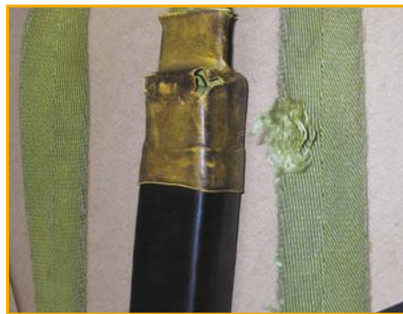
Figure 1 Damaged webbing and protector to energy absorber

The following photographs show lanyards that have been withdrawn because of damage suffered during use.