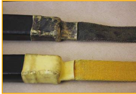
Figure 5 Two similar products with unknown history – the top webbing is heavily soiled

Remember: When checking or inspecting lanyards think WEBBING – STITCHING – HARDWARE