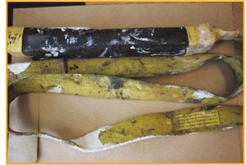
Figure 6 Heavy paint contamination to webbing