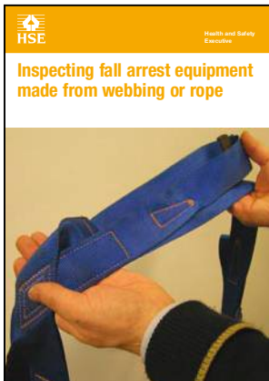
This is a web-friendly version of leaflet INDG367