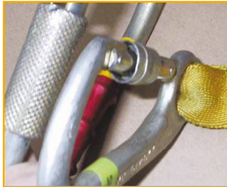
Figure 7 Damaged gate on karabiner