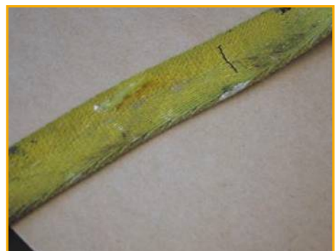
Figure 4 Surface fibres damaged by abrasion